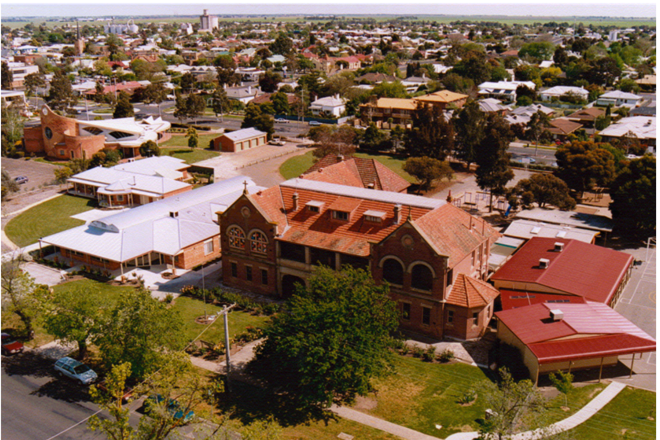
Former Brigidine Convent and Ss Michael and John's Primary School Buildings