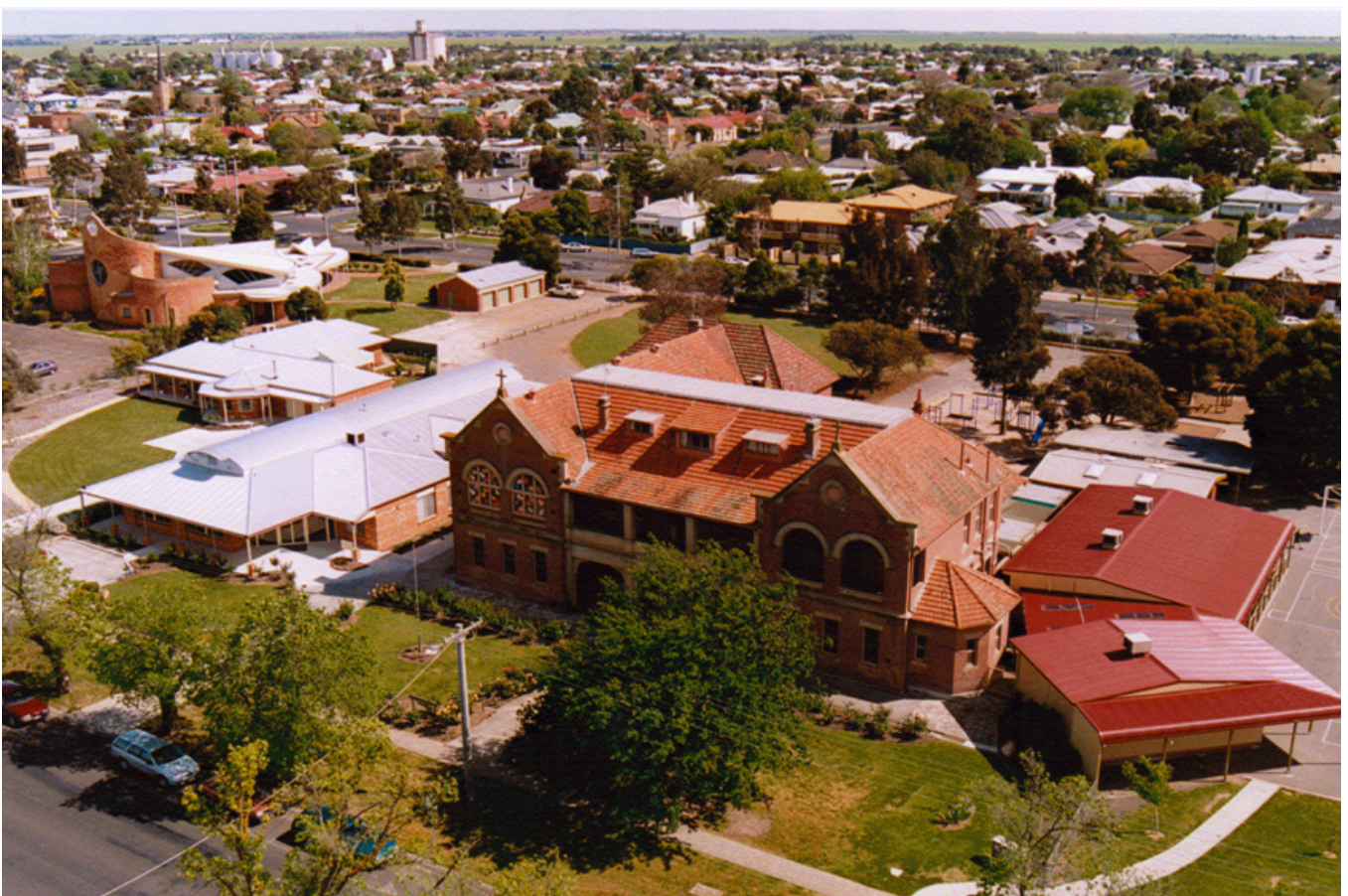
Former Brigidine Convent and Ss Michael and John's Primary School Buildings