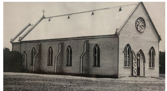
The first Horsham Catholic Church, built in 1876. Classes were conducted in this church between 1884 and 1900. When a new brick church was built in 1914, this building was re-sited and again used as the parish primary school through until 1937. The building was demolished in 1962.

In 2010, Ss Michael and John's was delighted to complete a major building and redevelopment program. A brand new school building incorporating all learning areas, an administration wing and staff area was constructed.