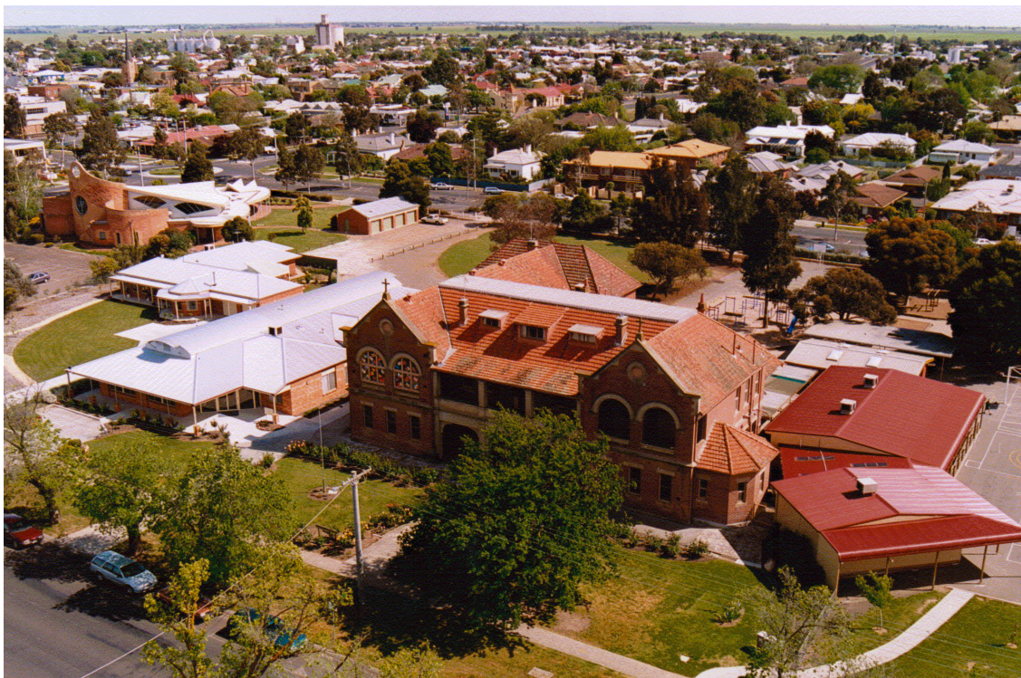
Former Brigidine Convent and Ss Michael and John's Primary School Buildings

In 2010, Ss Michael and John's was delighted to complete a major building and redevelopment program. A brand new school building incorporating all learning areas, an administration wing and staff area was constructed.